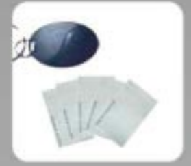
RF Card and Key Fob